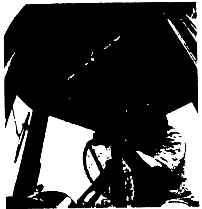
CONTROL. A modern farmer adjusts the climate inside the cab of his air conditioned, radio-equipped tractor in a California field. Equipment such as this can cost upwards of $20,000.

"But if a husband-and-wife farming team make up their minds that they're going to do something, there's nothing in the world that can stop them."