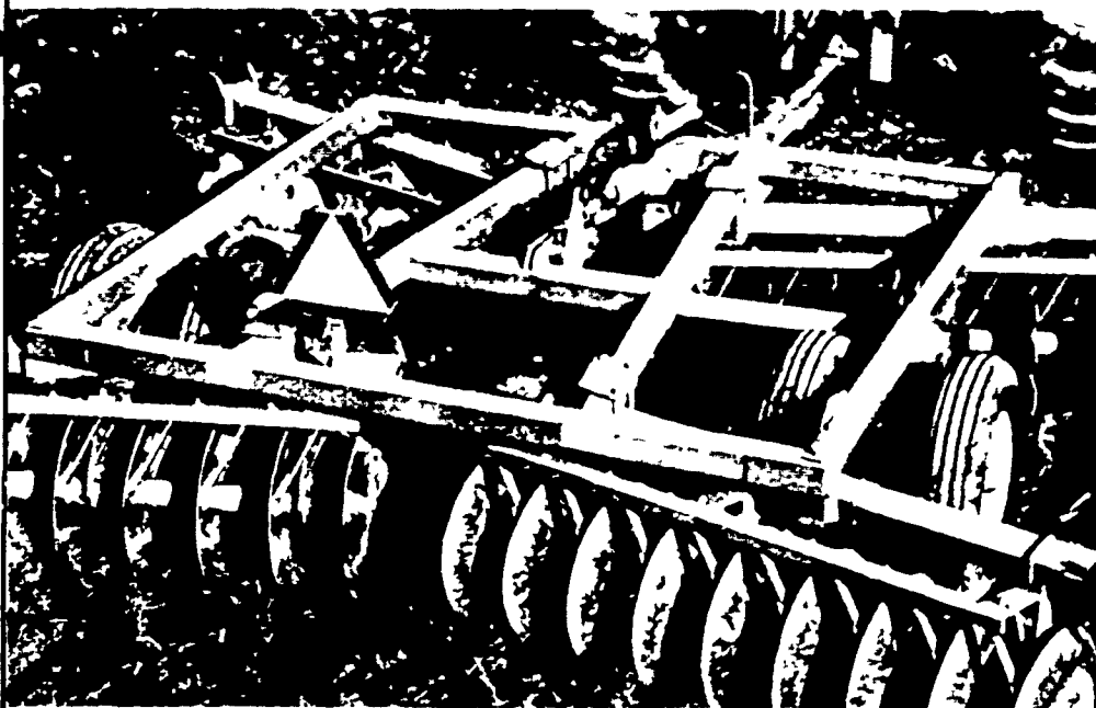
TANDEM DISK HARROWS

Built like the strongest, priced with the lowest