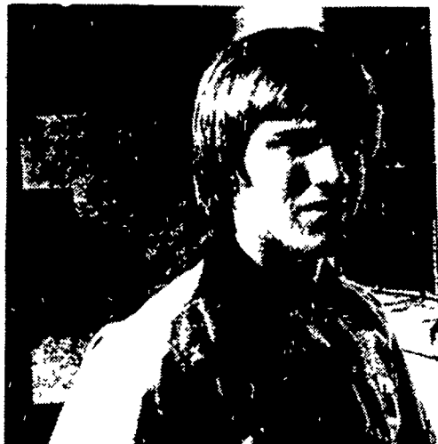
Mechanic - Small Engines & Cadets

WAIVER OF FINANCE ON TRACTORS AND EQUIPMENT SOLD WITH TRACTORS INTEREST FREE — 3-1-77