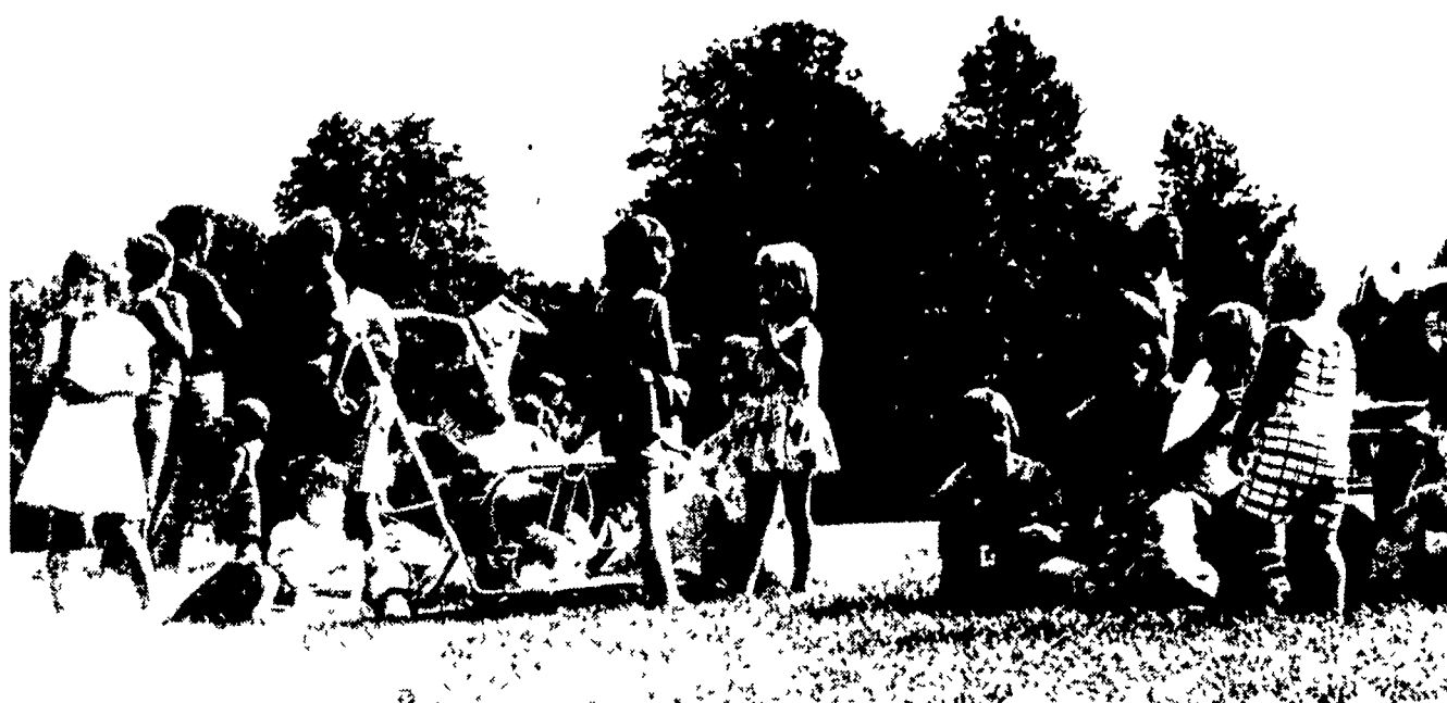
The weather was great for the Lancaster County Farmers Association picnic, held recently at the Solanco Fairgrounds. The word from Washington D.C. is that very specific weather reports for agriculture are likely to be put into service early next year. With that Lancaster County will become the first county in the nation to have such a farm weather forecast.

Special equipment made available by the telephone company will ensure that callers get through to the recording without delay. A