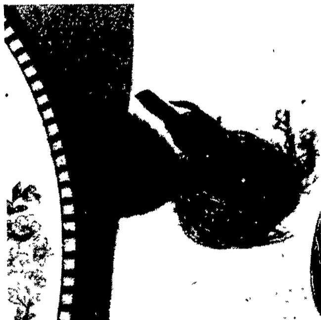
Tiny bird's nest napkin holders can accent a table setting to give it a dainty touch.

MATERIALS The materials needed are mostly things found around the house and farm. The