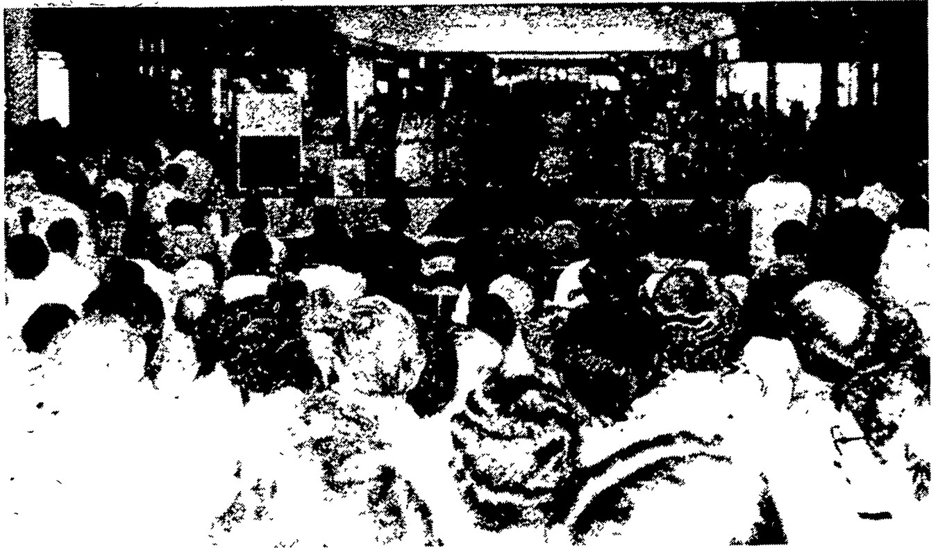
The Berks County Dairy Princess Pageant was held at the Berkshire Mall, just west of Reading, and drew large crowds. Other attractions included

All ten of the girls, as well as dairy princesses from previous years and coor-