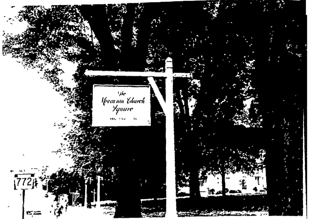
A guidepost to visitors, the sign in front of the Moravian Church complex, bears the date of the founding of the religious movement in this area.