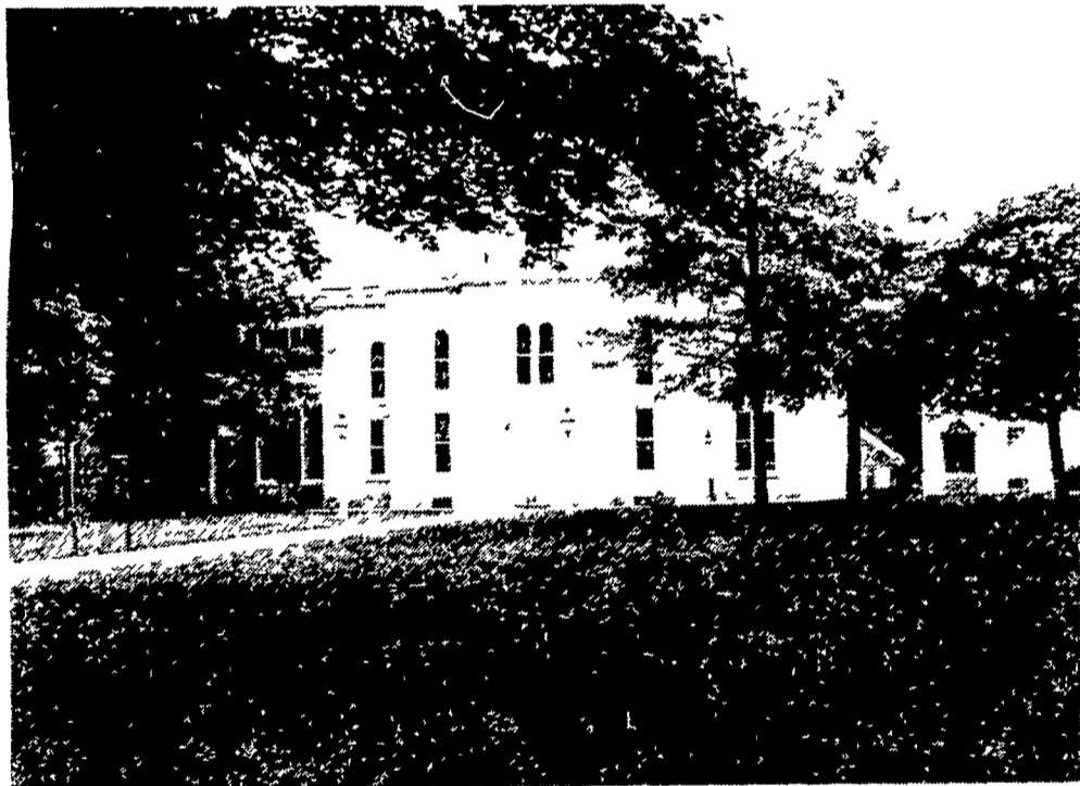
The Lititz Moravian Church stands quietly much as it did two centuries ago

still remain as a memorial to those people who planned Lititz as a free religious community.