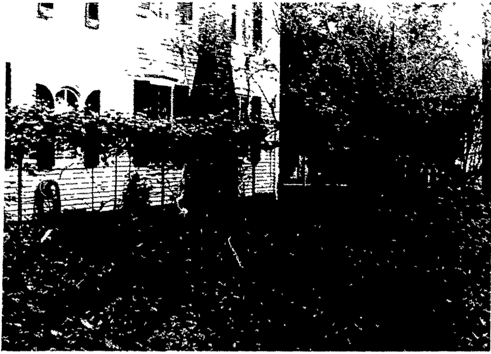
A rose garden symbolic of the landscaping in Lititz reflects the colonial air of the town.