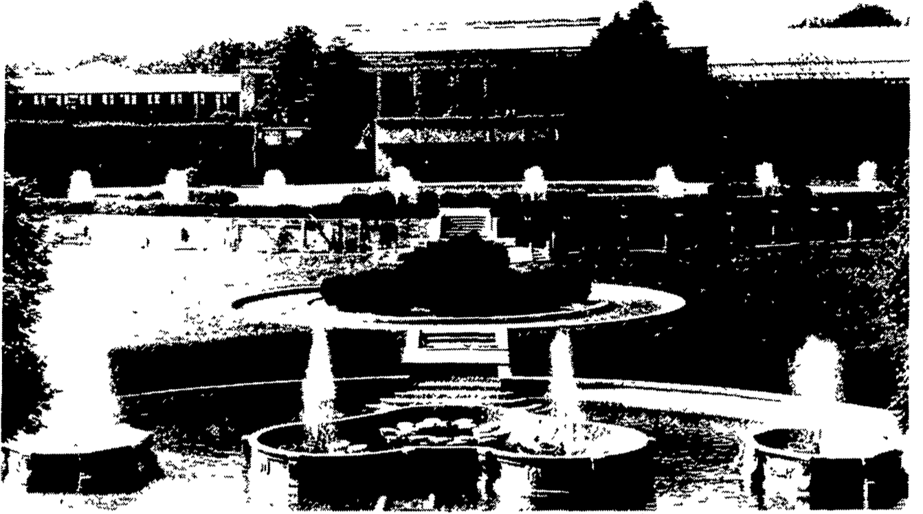
The main conservatory at Longwood Gardens from the main fountain garden.

"In the two largest conservatories at Longwood, the Orangery or "Main Conservatory" and the Azalea House, the displays change constantly, marking the seasons with thousands of beautiful flowers. Plants are exhibited only at their peak; as soon as the flowers show any signs of aging, they are replaced with new plants from Longwood's extensive growing houses. Three spectacular displays each year concentrate on traditional holiday plants and attract thousands of visitors. At Easter the