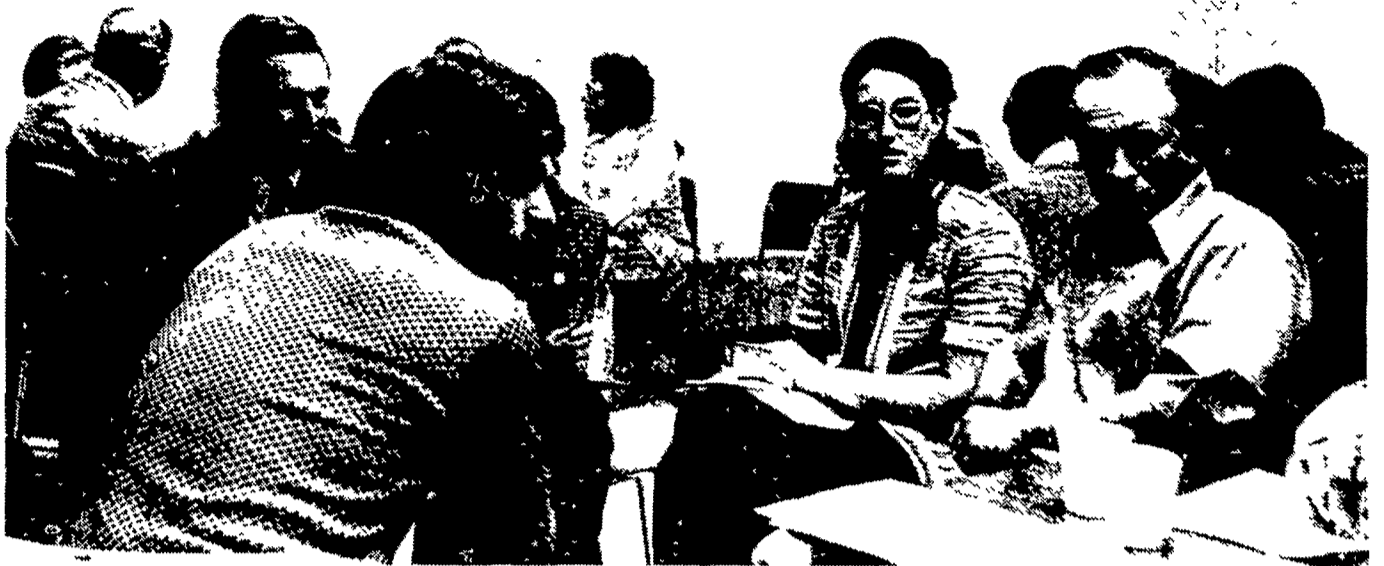
Approximately 40 members of the Lancaster County Farmers Association met at the Farm and Home Center Wednesday evening to discuss and

prepare plans for a grand scale public relations effort at Park City in October.