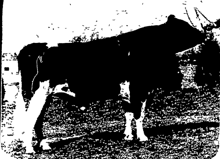
(7H196) Coldsprings Stylemaster Amos

USDA Sire Summary (Jan 1976) 28 Dtrs. (27 Herds) 16.624M 3.57% 594F Pred. Diff. '76 +1058M -.06% +30F Repeatability 57%: Dollar Difference +$83