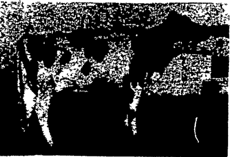
Number 16-Grade 2-4-302d 2X 18.199M 3.4% 627F (In Progress) Owner: Marron Randolph, Sweetwater, Tenn