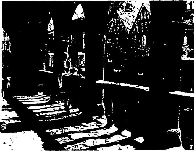
THROUGH A CHILD'S EYES—It's not difficult to imagine a coach and four pulling up to this centuries-old English tavern.

American Tourists Discover Highlights Of Europe