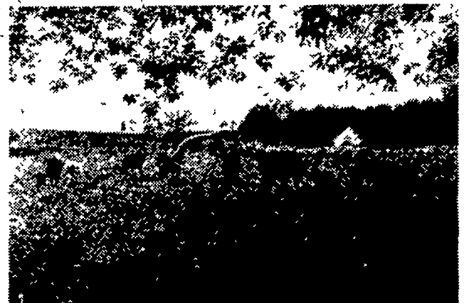
Peacefully grazing on pastureland.