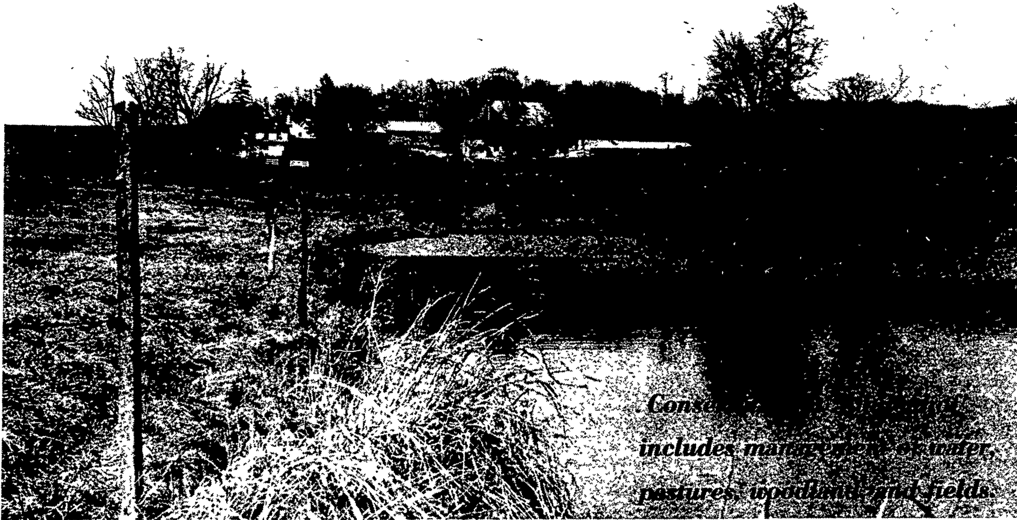
Conservation practices include management of water, pastures, woodland and fields.