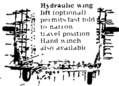
Hydraulic wing lift (optional) permits fast fold to narrow travel position. Hand winch also available.

Teaming a 250 tine harrow with your Brady cultivator (any size) gives you quality one-pass seedbed prep after plowing. Brady tillage saves you time you hp you fuel your labor! Before spring work starts write for literature - or see your Brady dealer. He's eager to deal.