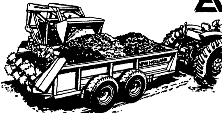
Model 790 Spreader

We Have the Type & Size Spreaders to Fit Your Needs for the Winter AND SPRING Season.