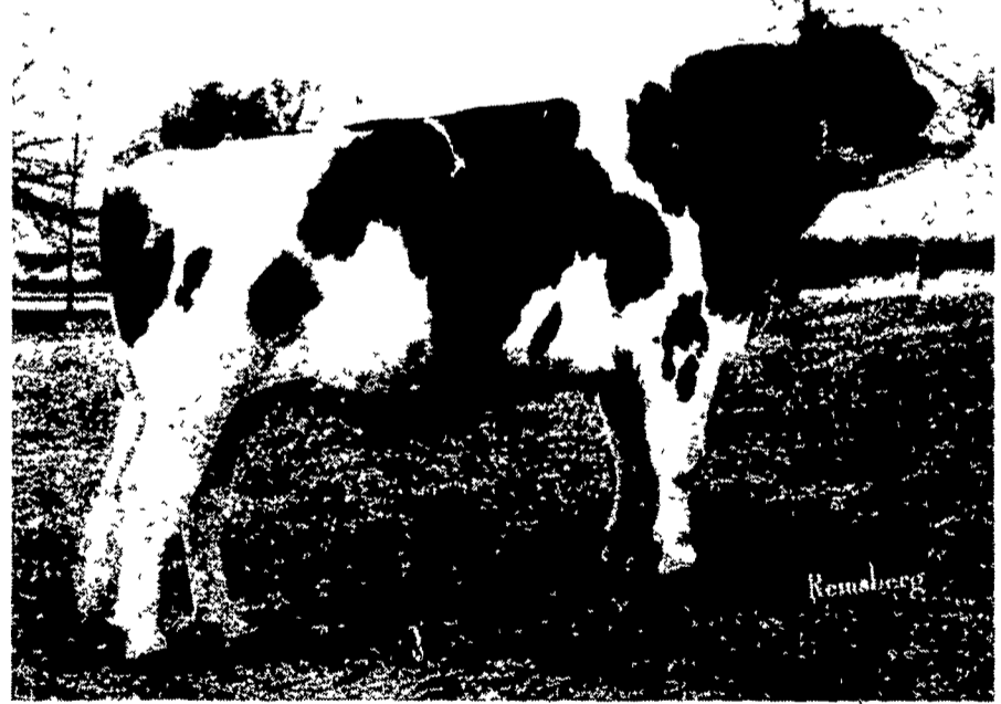
15H144 Howacres STYLEMASTER Prince

USDA (Sept./75) — 33 Daus. in 10 Herds Ave. 17,033M 3.72% 633F Predicted Difference (49% rpt.) +381M +$21 +1F Type: 19 Pr. Classified Daus. Ave. 83.4; +1.12 PDT Sire: Quin-Lynn Triune Prince — VG(88) & GM Dam: Kanawaka Burkgov Lucky Mandy — EX