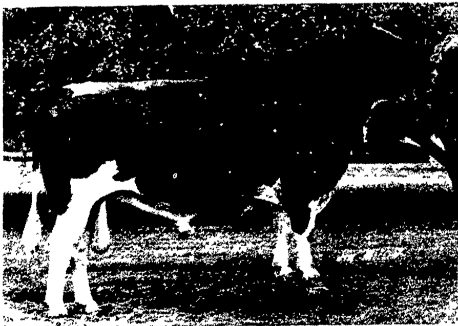
15H161 Kanawaka EDUCATOR

These Plus-Proven Sires Are Available Daily For Your Dairy Herd: