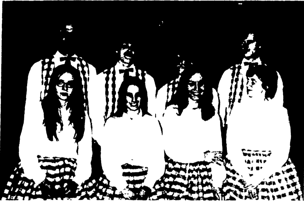
Shown are the Twin Valley Young Farmer square dance set who recently danced at the Farm Show. The couples are from left to right:

The square dance program is designed to encourage participation and elevate the standards of performance in folk dancing.