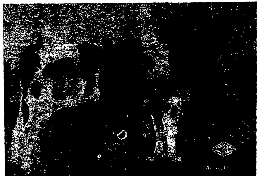
(7H156) LIME HOLLOW ADMIRAL DEKOL Very Good (88)