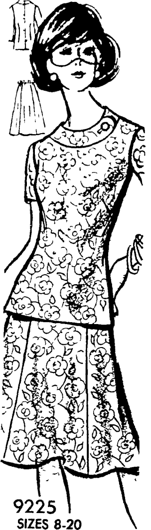
9225 SIZES 8-20

Printed Pattern 9225 Misses' Sizes 8, 10, 12, 14, 16, 18, 20. Size 12 (bust 34) takes 2 1/2 yards 60-in fabric