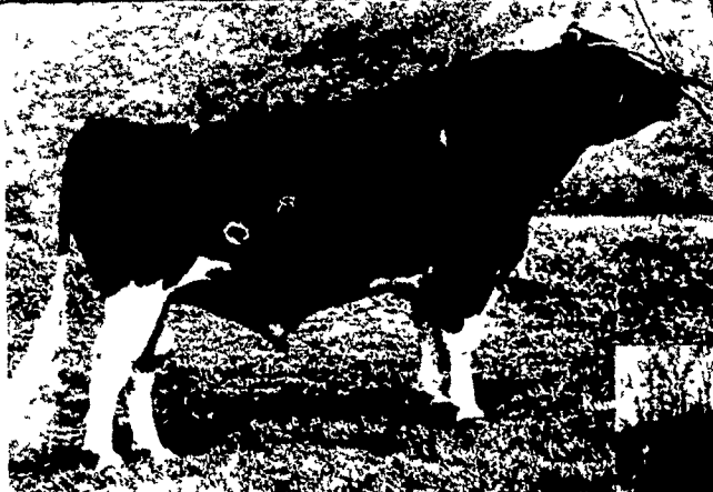
9H129 Kingstead RISE - twin, GP(84), PQ 9/75 USDA 9/75 RIP 76% Rpt 65% 45 ctrs. 35 herds avg 16491m 3 31% 546f PD74 +1139m - 19% +12f +$71