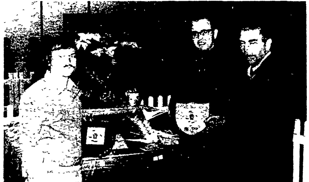
Lancaster County egg producers finished stronger than ever before at this year's Farm Show. All of the best eggs of the entire show came from Lancaster County, and two perfect scores were achieved for the first time ever. The 100 point ratings were achieved by Dutchland Farms and R.