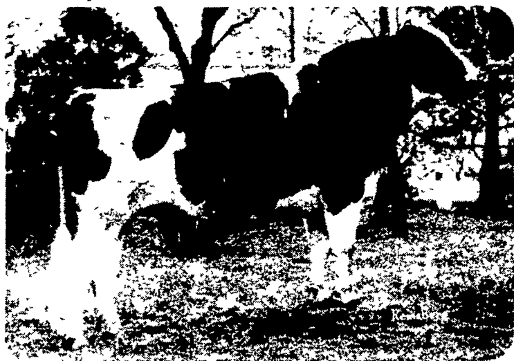
(7H431) Huberview Monarch, Very Good (86)

Yes, the first proven son of Select Sires' Woodbine Pearl Comet has made the big time. According to the latest USDA Sire Summary (Sept. 1975), HUBER is plus across the board for milk, percent test, fat and dollar value. The type pattern on the HUBER daughters is outstanding too. He is an outstanding improver of udders - siring udders that are high and wide in rear, strong in center support and smooth in fore with proper size and placement of teats. HUBER sires much depth and width of body with wide level rumps. You can use HUBER to correct set and bone in rear legs. ORDER A GOOD SUPPLY OF HUBER SEMEN NOW! $5.00 per unit.