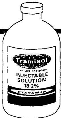
Takes the guesswork out of worming