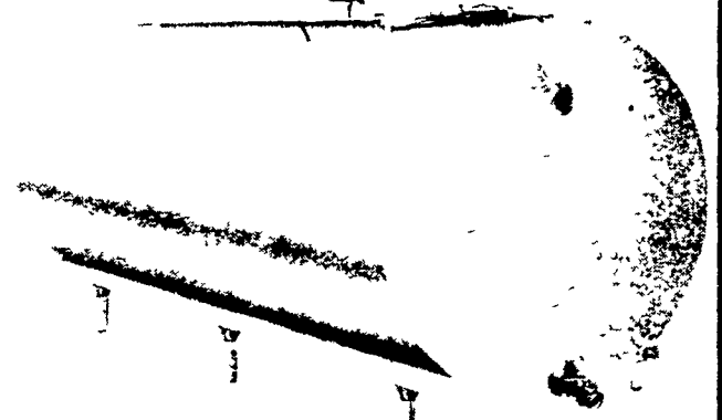
Model DKE - Direct Expansion 450 to 3000 Gal. Tank

DARI-KOOL BULK MILK TANK SAVINGS OF $250.00 TO $2500.00