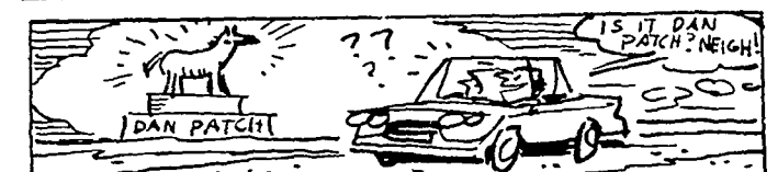
America's first genuine sports hero was probably nationally beloved horse named Dan Patch, a crooked-legged bay born in 1896 and the first race horse to earn a million dollars for his owner.

The Extension leaflet "Indoor Care of Christmas Trees and Greens," will help you identify these Christmas tree species. Get your free copy from your Cooperative Extension Service office.