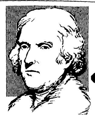
I steer my bark with hope in the head, leaving fear astern

Now that she has gone back, I'll have to start making Christmas cookies as I've invited 65 relatives for the Holidays.