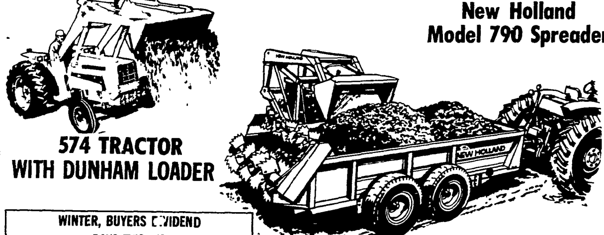
574 TRACTOR WITH DUNHAM LOADER

FOR BETTER MANURE HANDLING THE PERFECT TRACTOR - LOADER TEAM