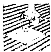
Easy hook up with wide opening jaws of Pin & Plate

Hitch this versatile trailer to your truck for road travel, switch it to your tractor for field loading. The Winnebago Agri Trailer can carry as much as a 3 ton truck. It can haul over 7½ tons Or 285 bushels of grain. Winnebago's 5th wheel design gives unique stability. It turns short, backs up easy, and trails true at highway speeds without fishtailing.