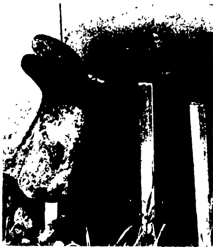
Wooden stakes keep boots together as well as allowing them to dry out while the men are in the house.