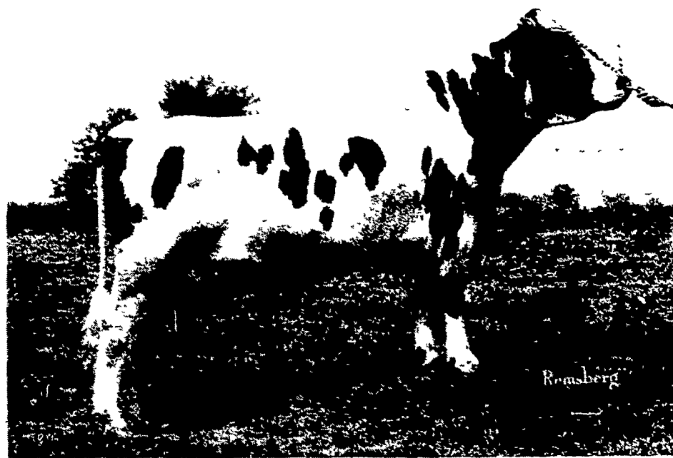
15H140 Round Oak ELECTRON

USDA (Sept./75) -2.841 Daus. in 1.040 Herds Ave. 15,062M 537F 3.57% +698M+7F +$43