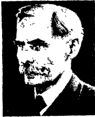
Congressman Andrew Volstead

buyer wasn't handling his product in the right way—he could take care of his own marketing.