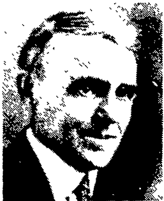
Senator Arthur Capper

An important part of Senator Capper's and Representative Volstead's original idea was granting the farmer the option of starting his own cooperative company if he wanted to. This meant that if he didn't like the price offered by a big processor—or for that matter, if he felt the