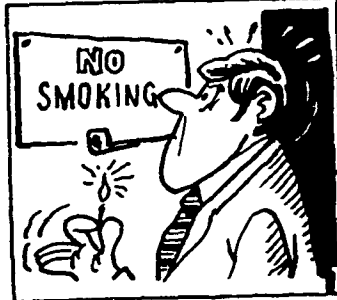
The elevator isn't a smoking car, so observe the no-smoking rule (No butts about it).

The NFSA is an international organization headquartered in Peoria, Illinois, and represents more than 1,060 member companies and independent liquid fertilizer dealers in the U.S., Canada, Mexico, South America and Europe. Members also include major oil, chemical and additive companies, plus equipment manufacturers and agriculture laboratories.