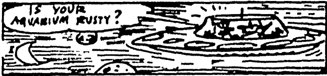
Moisture can damage metal parts of a home aquarium. To retard rust, smooth on petroleum jelly.