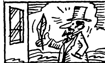
In Hungary at one time only a man who had slain a Turk might wear a feather.