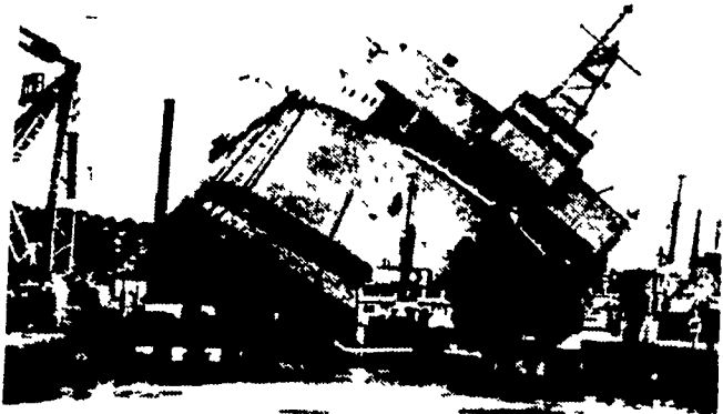
TIPSY...An old Navy floating drydock 81 feet was squeezed through the 80-foot wide Government Locks between Puget Sound and Lake Union recently by tipping it at a 38 degree list. It will be used to build a fleet of ecology vessels.

A voluntary conservation drive of the dimensions the Secretary has in mind could keep an estimated 1 to 2 billion tons of soil on land that might otherwise be eroded away each year.