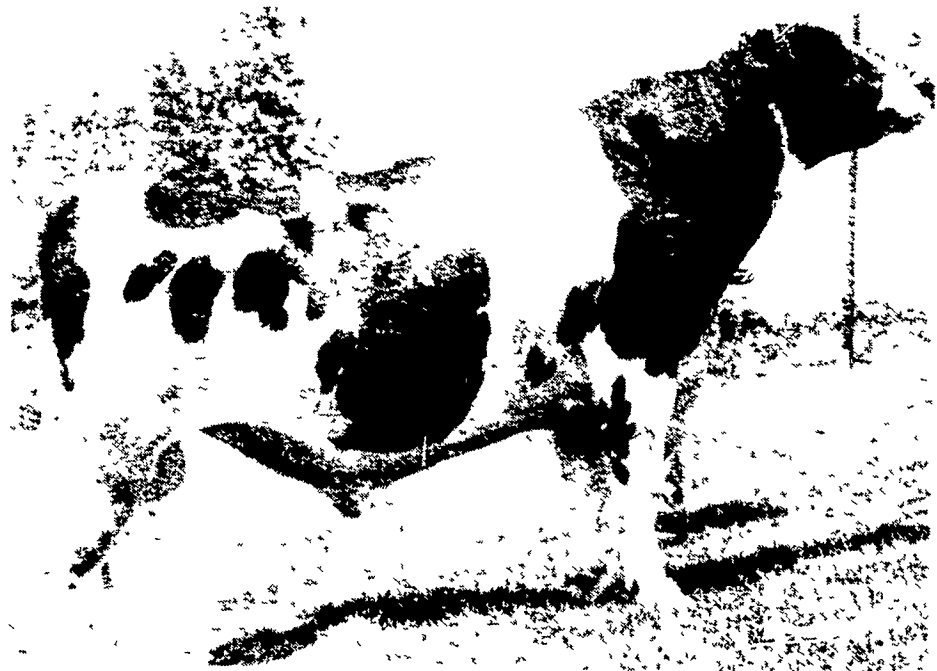
15H139 Curtis-Haven Apollo VICTOR Good Plus & Type Qualified [Sept./75]

These Plus-Proven Sires Are Available Daily For Your Dairy Herd: