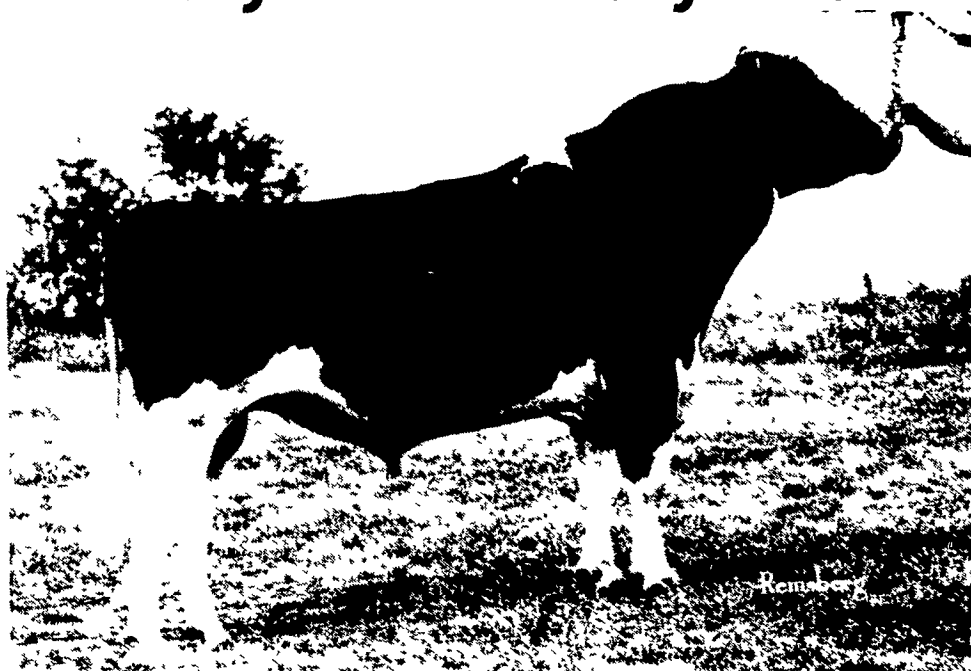
15H151 Cumva PROUD Performer Very Good [87]

USDA (Sept./75) - 112 Daus. in 80 Herds Ave 15.080M 3.58% 540F Predicted Difference (83% rpt.) +599M +$30 -2F Type: 25 Classified Daus. Ave. 79.8; 22 Pr. +1.05 PDT Sire: Hilltop Apollo Ivanhoe - VG (89) & GM Dam: Anderson Von Performer Velge - EX (92) 2E