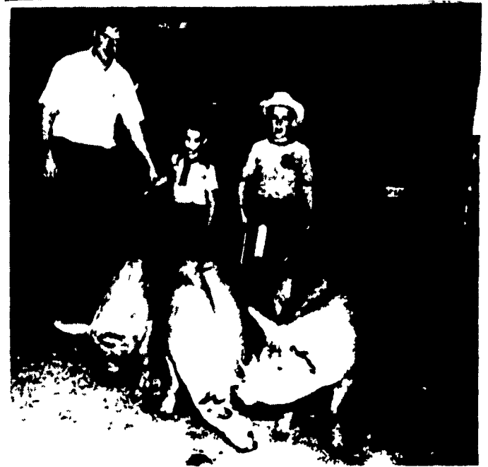
CHAMPION TRIO OF 4-H PIGS CUMBERLAND COUNTY