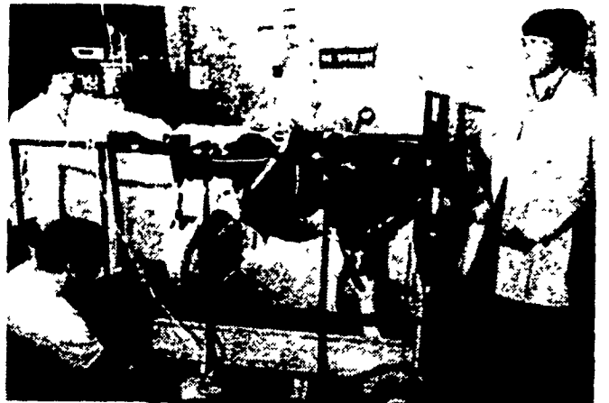
CRITTER, a calf whose electrically powered heart has been humming for two weeks, takes a stroll on a treadmill at the University of Utah Division of Artificial Organs. Scientists plan to put an atomic-powered model in their next experimental animal.