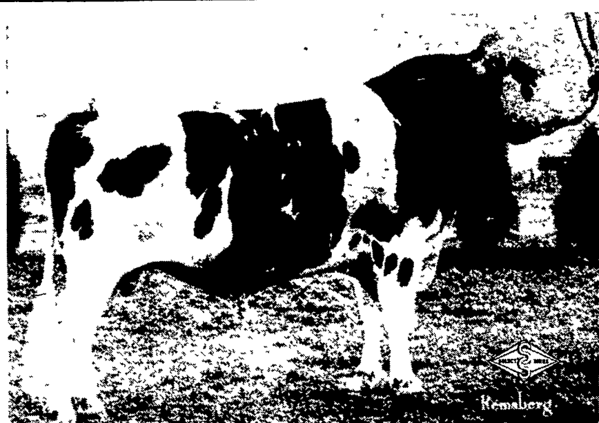
(7H156) LIME HOLLOW ADMIRAL DEKOL Very Good (88)