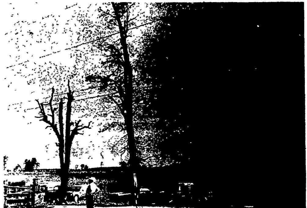
Three black walnut trees which lined the lane to Shenk's property near Annville were stripped of bark