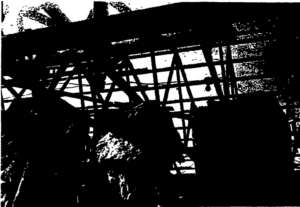
Bare framework and shreds of insulation were the only materials left of a hog house standing on the Shenk