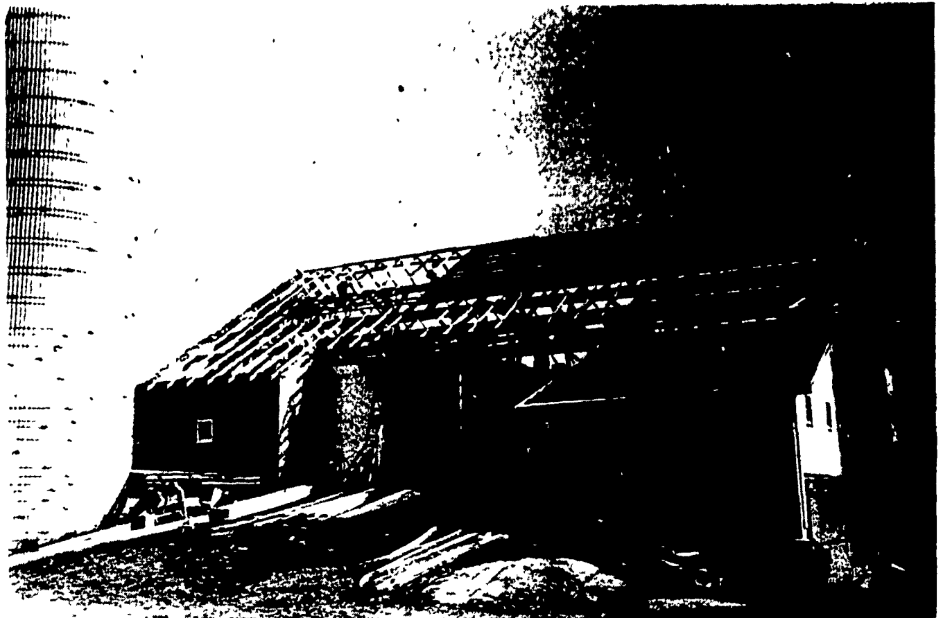
Volunteer workers labored for hours to replace the barn roof at the Roy Shenk property near

Although the silos on the property were steady enough to withstand the intensity of the wind and pressure, Shenk noted that the smaller