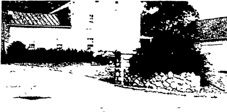
Photo of Stone House