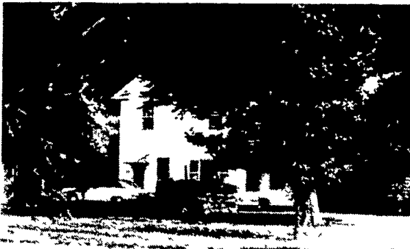
Photo of Main House

Very fertile mostly level land, large main home with full basement with Sona bath and kitchen, 1st floor modern kitchen, large dining room, living room with stone fire place, open stairway. Small office quarters. 4 bedrooms, wall to wall carpet. Oil baseboard heat, automatic air conditioning. Circular macaden drive way. Beautiful shade trees and beside a 5 acre lake with 17 1/2 acres. This is tract No. 1 will be offered alone and also with the rest of the farm, a real executive type home. Also 6 room frame tennant house, large storage and implement shed, 4 car garage and large bank barn. The main farm with the above mentioned buildings contains 214 acres with 6560 feet of road frontage along 895 and the Summer Hill Road. Also selling at the same time and place a beautiful