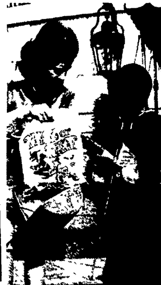
First Lady for UNICEF Longtime supporter of the U.N. Children's Fund, Mrs. Gerald R. Ford is Honorary Chairwoman for National UNICEF Day, the 25th anniversary of Trick or Treat for UNICEF. Mrs. Ford is pictured above greeting a UNICEF Trick or Treater at the White House last year. Sharing UNICEF Day sponsorship with Mrs. Ford will be Mrs. Nelson A. Rockefeller, Honorary Vice Chairwoman, and comedian Danny Kaye, National UNICEF Day Chairman.

Never place other foods on a surface where you have had raw meat or poultry until you have thoroughly cleaned it. Scrub the surface as well as dishes, knives and other utensils you've used with soap and hot water. This keeps harmful bacteria from spreading to cooked foods and salads.