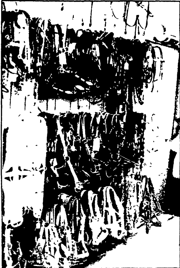
Large selection of Tack . . .