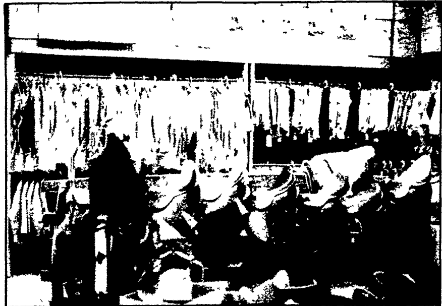
Saddles, boots, jackets and leather goods . . .

STORE HOURS: Mon. & Fri. 9 to 9 ; Tues., Wed., Thurs.: 9 to 5; Sat. 9 to 4