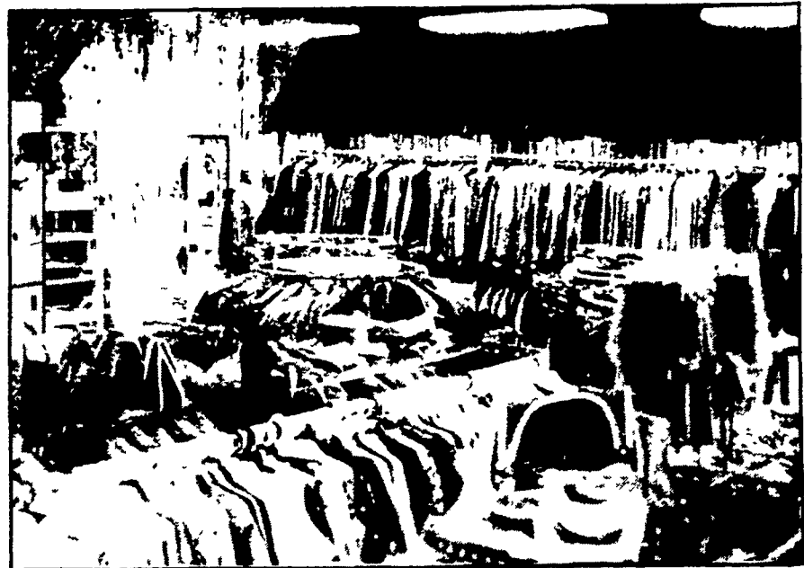
English and Western Clothing . . .