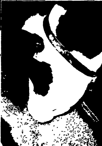
Only four pounds of Wayne Conditioning Ration per day helps the dry cow rebuild her body and develop a healthy calf!

USE WAYNE ANIMAL HEALTH AIDS TO KEEP YOUR LIVESTOCK AND POULTRY HEALTHY