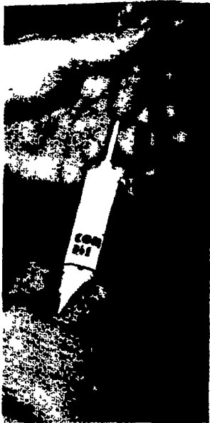
Wayne DriCow is an udder injection with special potency. Use it four weeks or more before freshening, to help insure a sound start toward production.