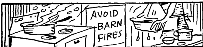
"Barn-burners" is a term which means destroyers, who, like the storied Dutchman, would burn down their barns to rid themselves of the rats.