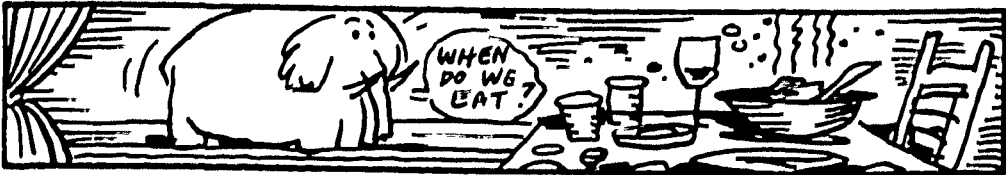
"White elephant" comes from the story of a King of Siam who used to make a present of a white elephant to courtiers whom he wished to ruin.