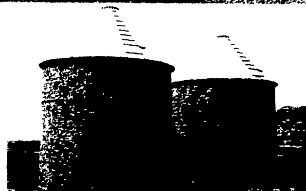
Wagons-Gravity Boxes-Corn Cribs