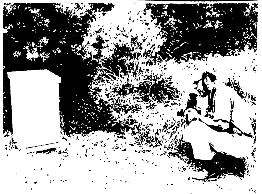
Heilman photographs activities of bees around one of the hives he

What Heilman calls the creeping metropolism of Lancaster County is the fact that, bit by bit, the county's farmland is being eaten up by industrial and residential development. It is the