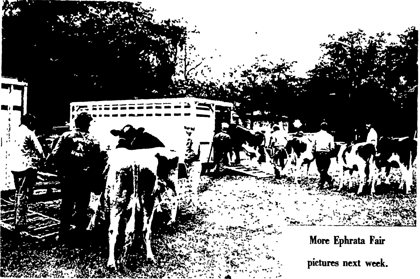
More Ephrata Fair