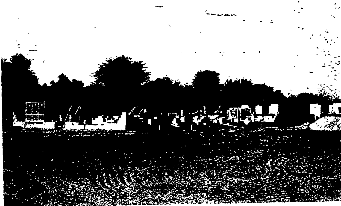
Coming: New Facilities to Better Serve You NOW UNDER CONSTRUCTION

NEW Massey Ferguson Dealer - NEW Facility Coming