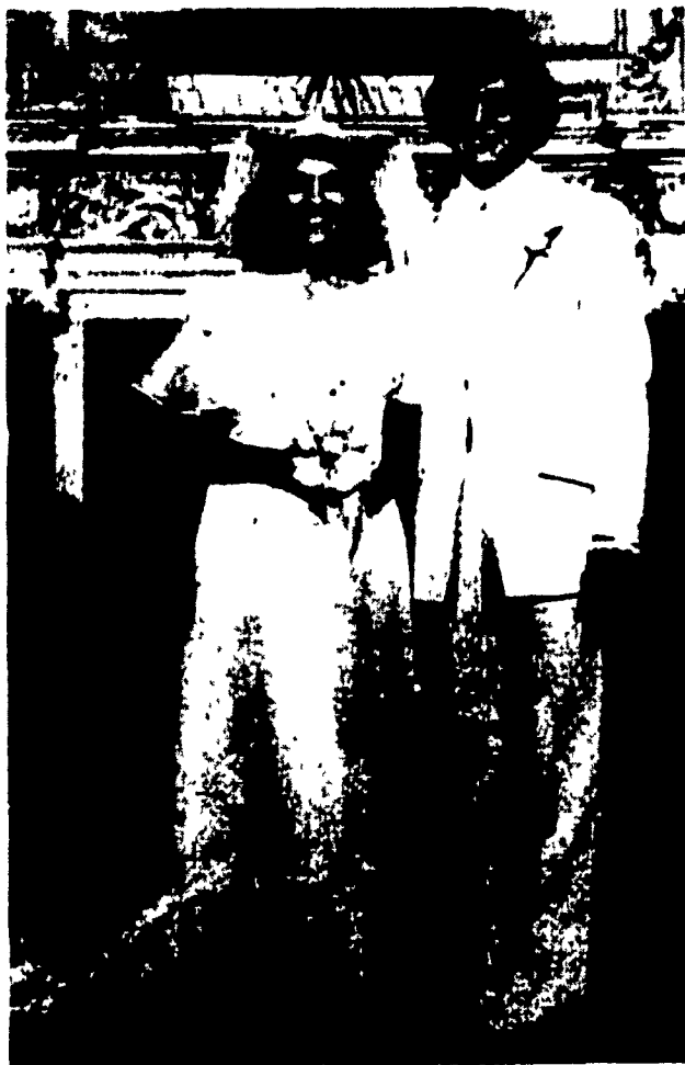
Hen Tamanini Photo

The next meeting will be a tour of Goodwill Industries.