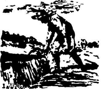
Solitary man with sickle symbolizes independence of early farmer.