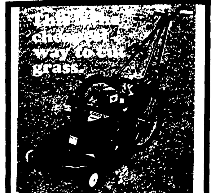
Figure it out. You can expect the average mower to last 3 to 4 years. That's the official industry figure. But the life expectancy of a Yazoo Big Wheel Mower is over 10 years. That includes the commercial users who work their Yazoo mowers 8 hours a day. Many homeowners are still using Yazoos they bought fifteen and twenty years ago. Try one on your home turf. 3½ to 7 HP; 20" to 26" cut. It's the cheapest way to cut grass. Come in today. Or you call. We'll haul — to your place.